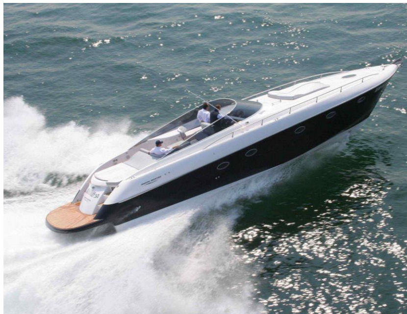
MIG 50 Marine Yachting